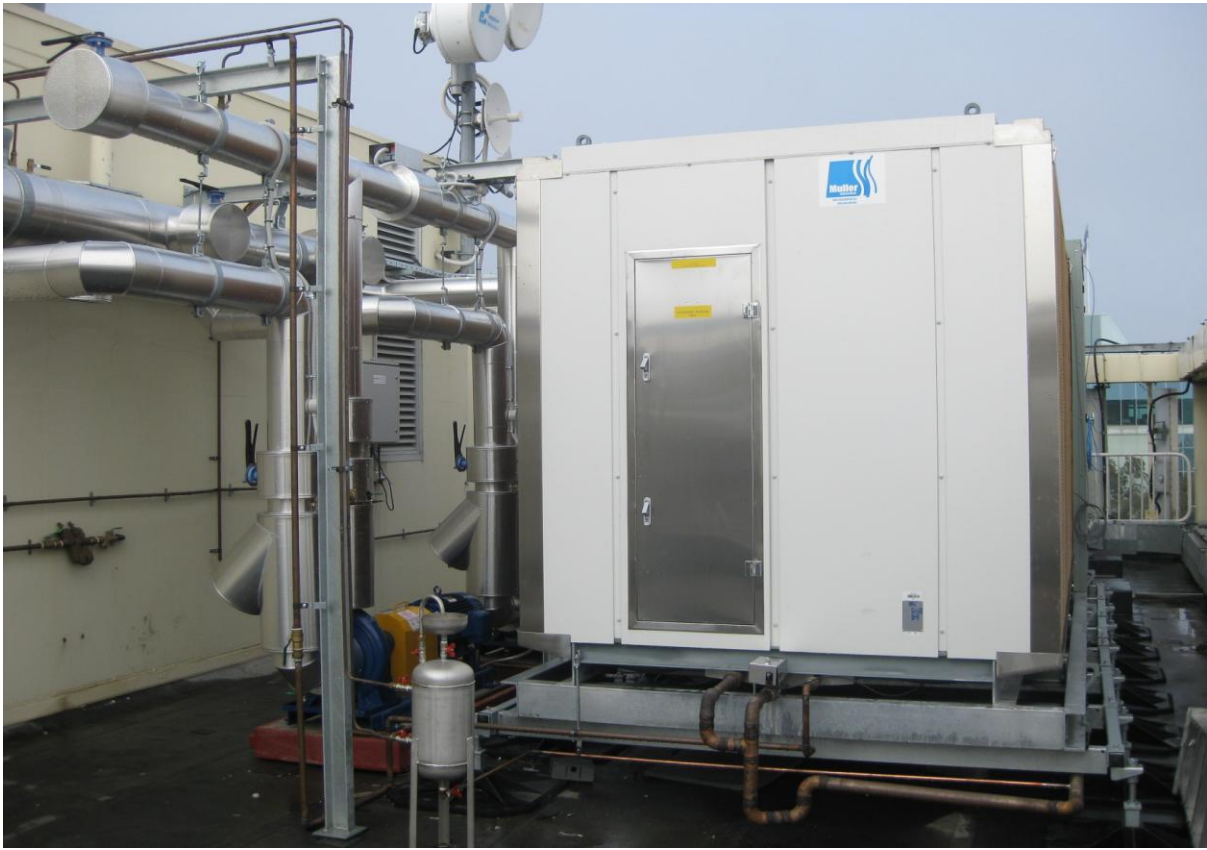
The end result was a very satisfactory one from the customer (Blacktown City Council) and M&H Air.