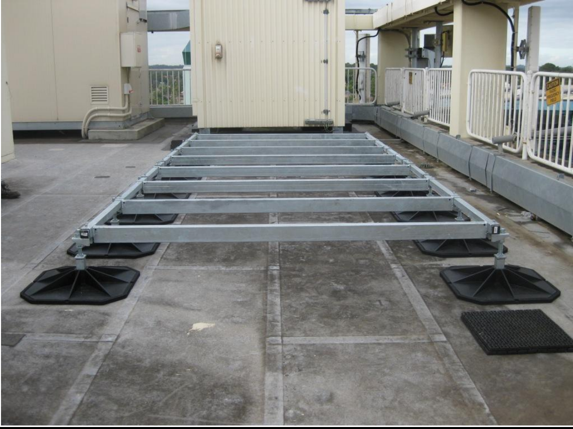
Images of Chiller in situ